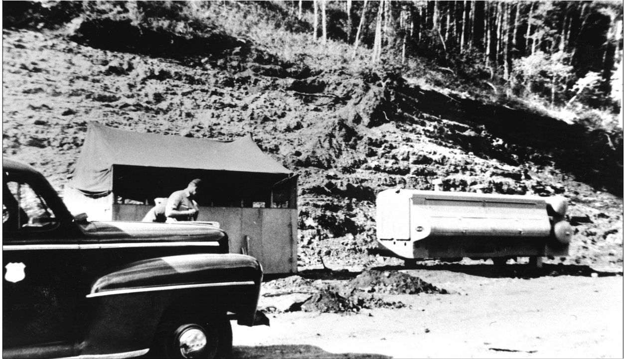
Figure 101. 500-hp Gardner-Denver compressor, Maybe Canyon underground mine.