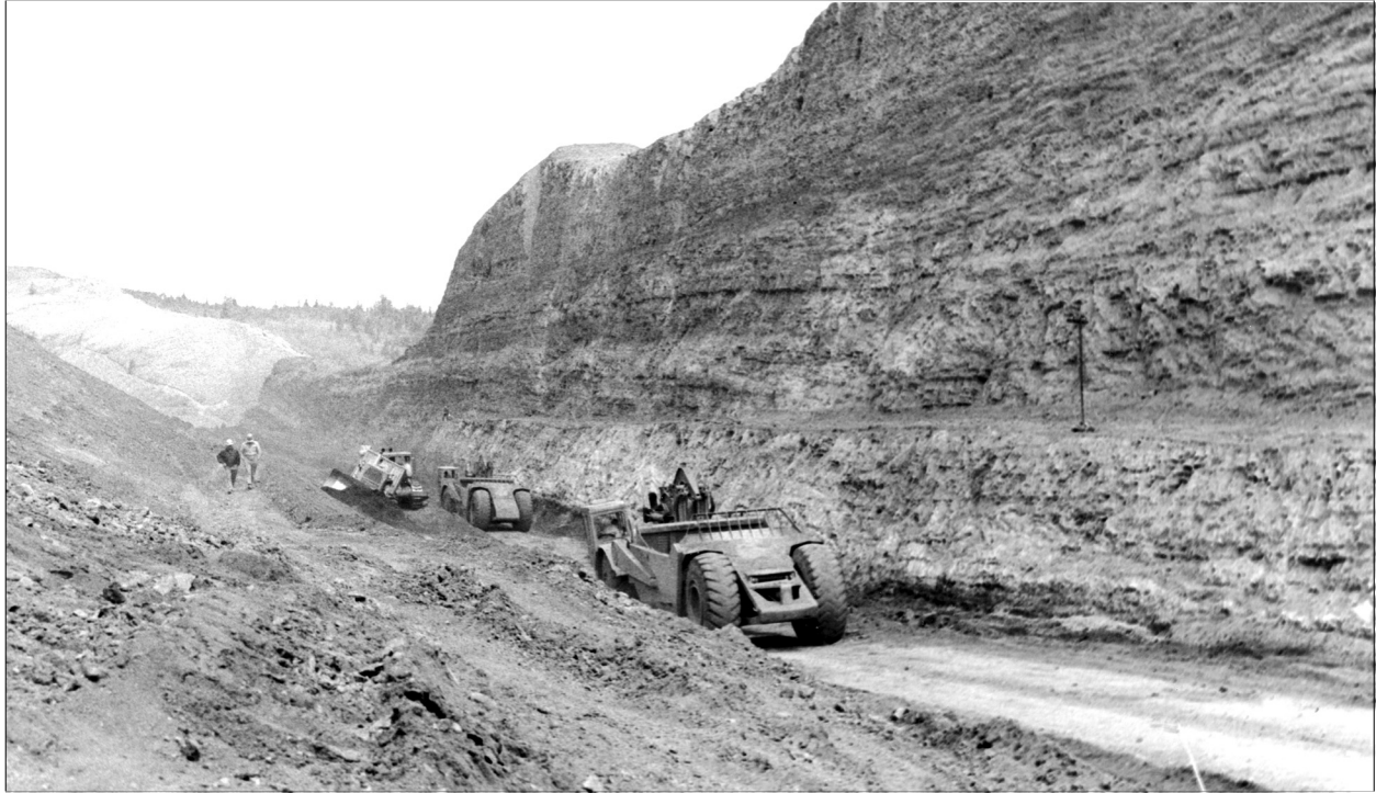
Figure 107. North Maybe Canyon Mine, August 5, 1966.

the old El Paso pit. Equipment used in mining included 15-inch bore hole drills, 85- and 120-ton haulage trucks, bulldozers, scrapers, and 16- and 24-yard electric shovels (Figure 108).