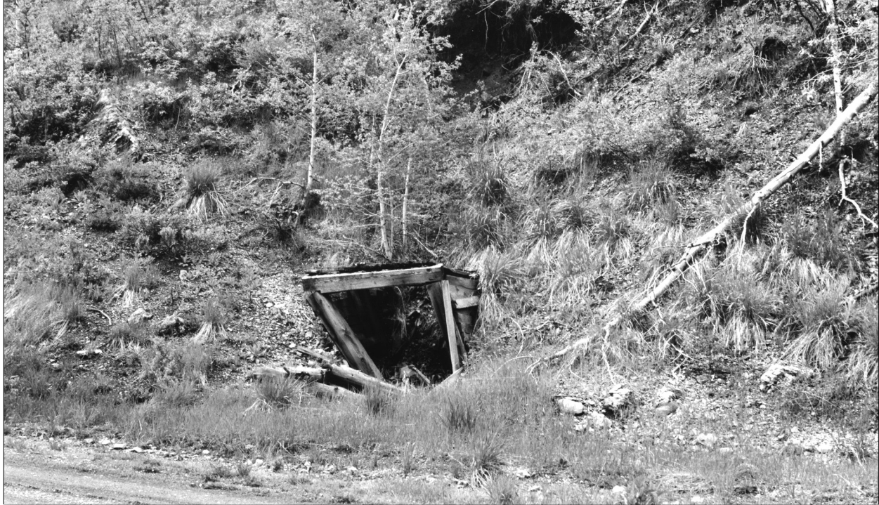
Figure 103. Caved adit of the Maybe Canyon underground mine, June 8, 1998.

Based on the exploration conducted on the lease during 1950-1951, WFA applied for a lease modification to add 200 acres to Lease I-04 and on September 30, 1953, the lease was so modified. In the period from late 1951 to early 1959, WFA conducted low level mining activities that consisted of the removal of overburden along the ridge immediately south of Maybe Canyon in preparation for mining (Cressman and Gulbrandsen, 1955), and scattered exploration activities throughout the leasehold.