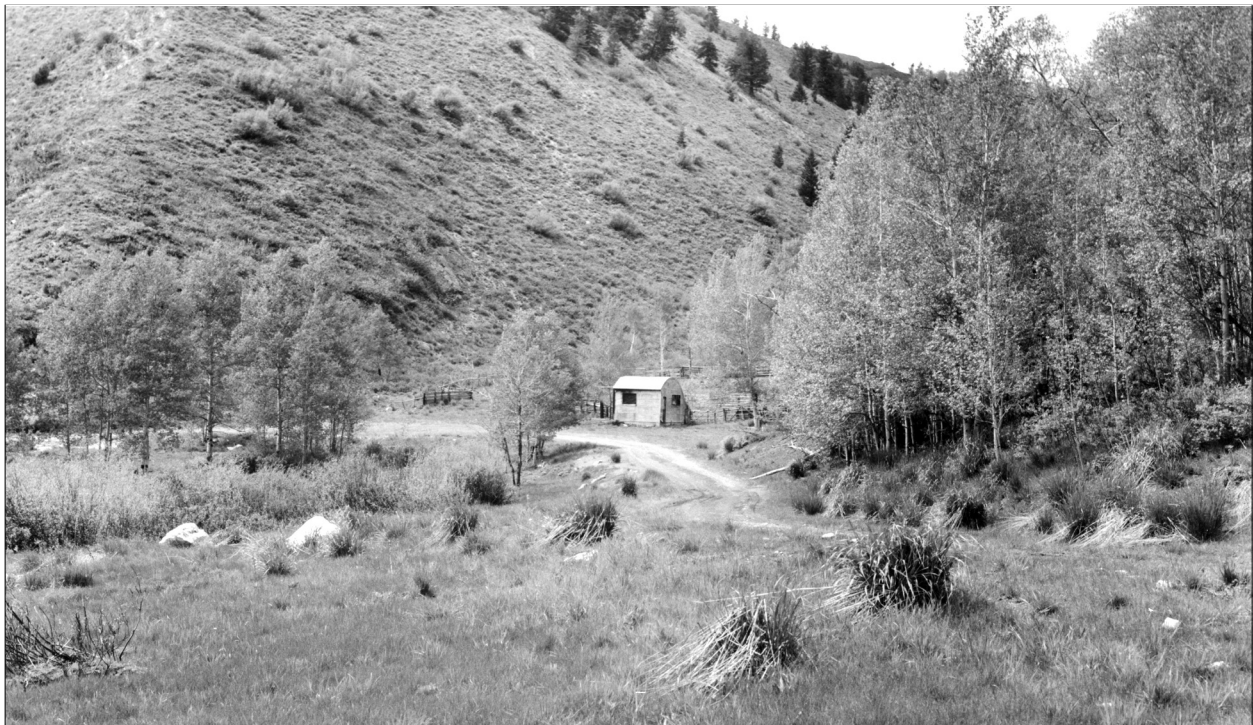
Figure 98. Area of the Western Fertilizer Association camp of 1950 in Maybe Canyon, June 8, 1998.

Immediately after the issuance of the Lease I-04, WFA established a field camp (Figures 97 and 98) and started construction of roads to the Maybe Canyon area and throughout the lease in preparation for mining. Underground mining was initially contemplated for Lease I-04. The WFA initiated mining on Lease I-04 in July, 1951 at a site in Maybe Canyon near the creek-level by excavating an area about 250 feet long by 50 feet wide and siting the portal area on an exposed 8-foot thick phosphate ore bed (Figures 99 and 100). Equipment used to excavate the tunnel was a 500-horsepower Gardner-Denver compressor and a one-quarter yard EIMCO mucking machine (Figures 101 and 102). The tunnel was driven 191 feet north and by the cession of excavation reported production was approximately 1,048 tons of 28% phosphate rock, all mined for bulk sample analyses, phosphate content, and processing characteristics (Krall, and others, 1985). Nothing further was done at the tunnel site and in August, 1961, the adit was sealed with 4-inch planks and all buildings and equipment were removed from the site. The final costs of the underground exploration was $23,196.33 for equipment and $15,320.03 for payroll, benefits, supplies and insurance for a grand total of $38,516.36. As of the writing of this report, the adit is completely caved to the portal with only a few timbers visible (Figure 103).