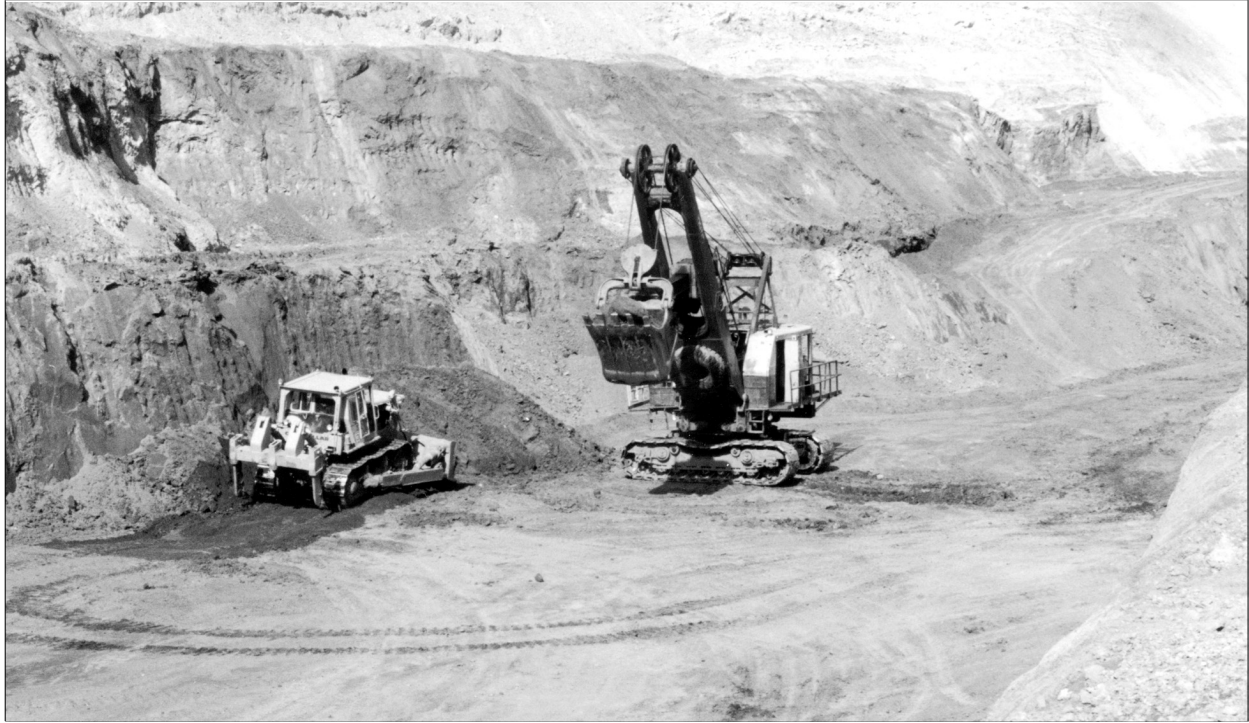
Figure 108. Maybe Canyon Mine, fall, 1978.