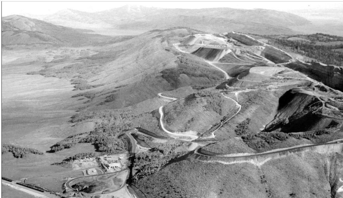
Figure 105. Maybe Canyon Mine, view north, August 12, 1975.

On November 1, 1964, Lease I-04 was assigned to the El Paso Natural Gas Products Company. Shortly after acquiring the lease, the El Paso company began to develop the North Maybe Canyon Mine and construction began on an 18-mile railroad spur between the new plant and the mine area. By the first of June, 1965, the site for the initial open pit had been cleared of brush and trees and stripping of overburden had started. At the same time, construction of a haul road from the top of Dry Ridge to a terminal on the valley floor was initiated (Figure 105). On August 2, 1965, the initial shipment of phosphate ore from the new mine was made to the Conda processing facility on the new railroad spur. Overburden stripping, mining and hauling of ore at the mine was contracted to Wells Cargo, Inc., of Las Vegas, Nevada. The new pit was located between Maybe Canyon and Kendall Canyon. The shipped ore was used for the manufacturing of triple superphosphate and ammonium phosphate fertilizers at the new plant (Day, 1973).