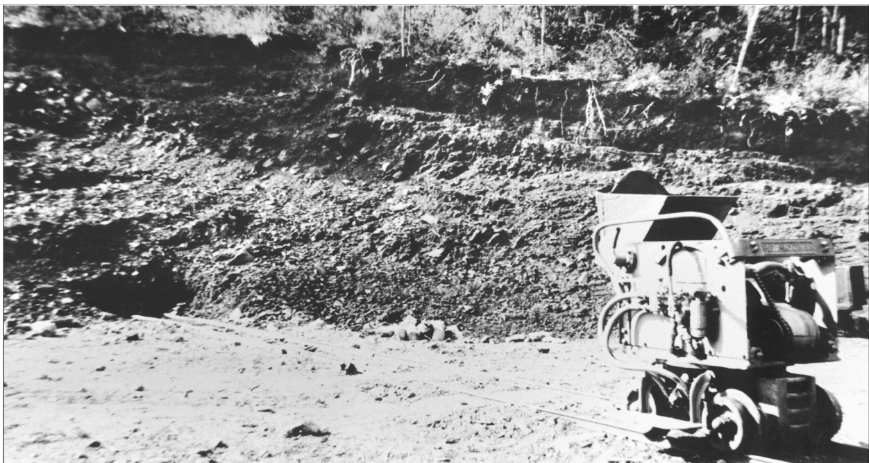
Figure 102. Western Fertilizer Association EIMCO mucking machine and face at Maybe Canyon underground mine, view northeast.