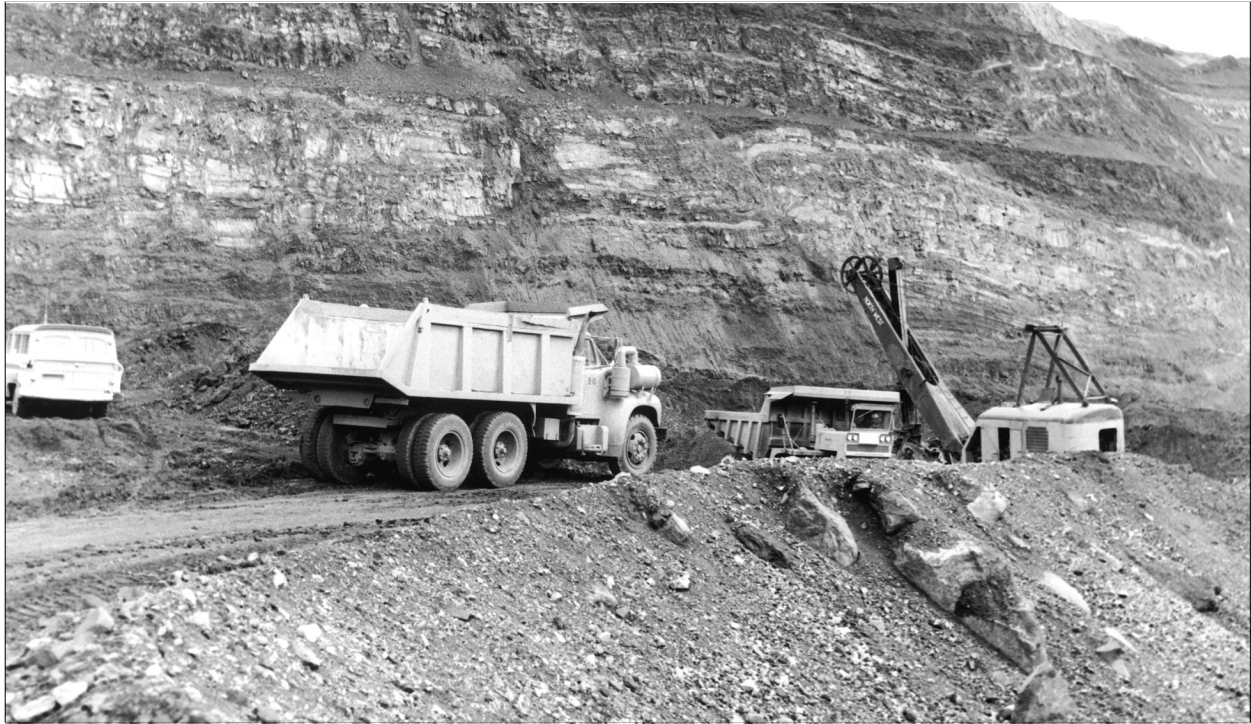
Figure 106. North Maybe Canyon Mine, August 5, 1966.

On January 1, 1966, El Paso Natural Gas Products Company changed their name to El Paso Products Company. Mining continued in the North Maybe Canyon Mine under the newly renamed company until 1967 (Figures 106 and 107). On July 19, 1967, the decision was made by the El Paso Products Company to close the phosphate mine and the associated mill facility at Conda due to the high cost of sulphur and the low price received from fertilizer sales. Operations finally terminated on October 31, 1967.